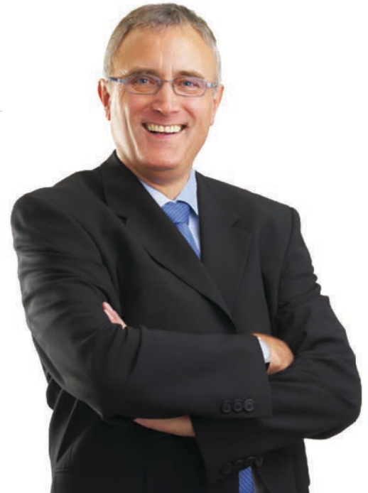
Contact SWEET! Feature Matrix